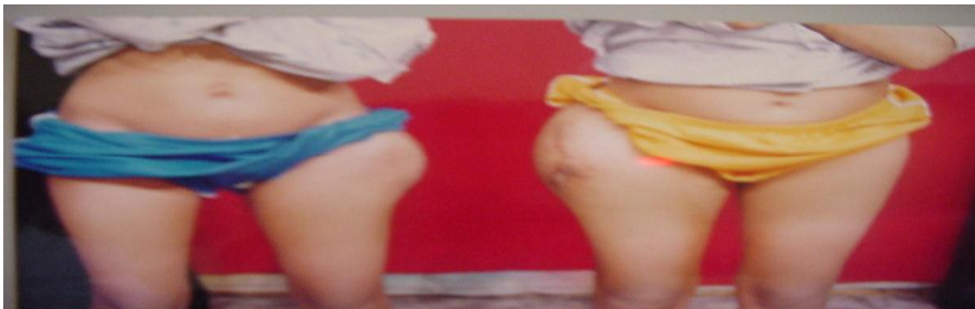
Fig 1: The thigh swelling of the two female siblings

Case 1: A female 17 years old, single and unemployed. Her main complaint was a swelling in the upper outer right thigh around the hip joint. It was preceded by a severe continuous pain in the same area two months prior to the appearance of the swelling. There was no history of trauma, fever, cough or weight loss. There was no limitation of movement in the right hip joint. She reported a total excision of the mass in her local hospital about a year ago. Unfortunately the specimen was not sent to any pathology laboratory and was thrown away. The swelling recurred rapidly, but this time was not preceded by pain. Local examination revealed a swelling involving the whole of the lateral aspect of the right upper thigh with a longitudinal surgical scar and a maximum diameter of 30 cm. and a width of 10 cm (Figure 1). It was firm and slightly mobile. A provisional diagnosis of a recurrent fibro- or rhabdomyosarcoma was made.