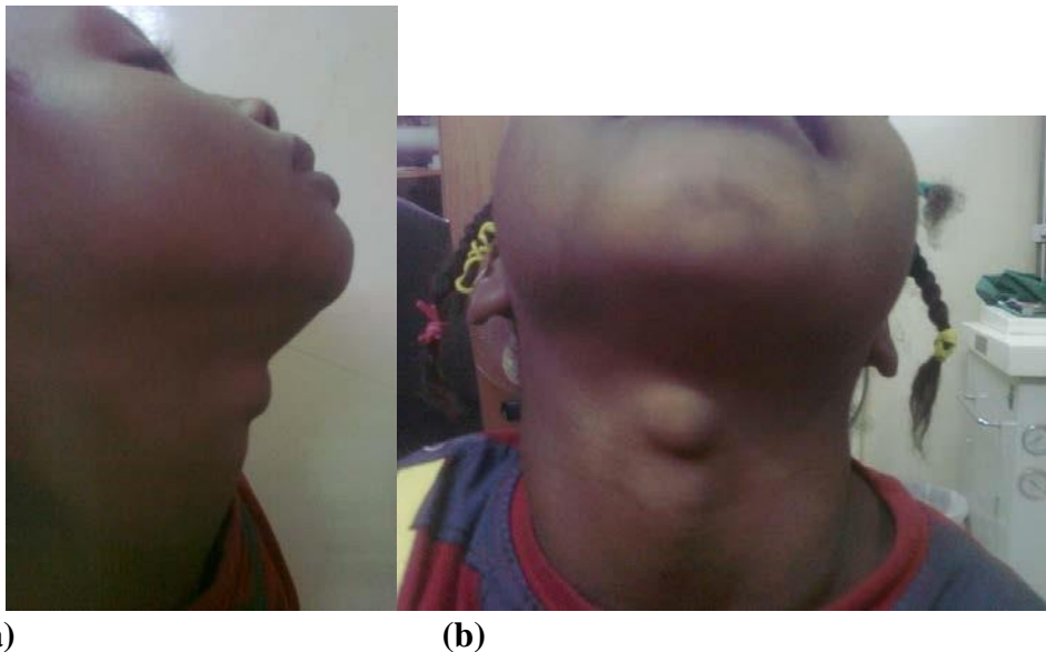
Figure 1: Patient's photo showing the mass; (a) profile and (b) front view. A provisional diagnosis of a thyroglossal duct cyst, supra hyoid type was made. A fine-needle aspirate of the swelling showed proteinaceous background and clumps of bland follicular cells, features were suggestive of thyroglossal cyst. There was no evidence of malignancy.

Physical examination revealed a rounded neck swelling in the sublingual region, measuring about 3 cm in diameter, not hot or tender, firm, with smooth surface, attached to deep structure, moves with swallowing and protrusion of the tongue and not compressible or pulsatile. No thyroid was felt in its normal position or any other cervical swellings (figure 1).