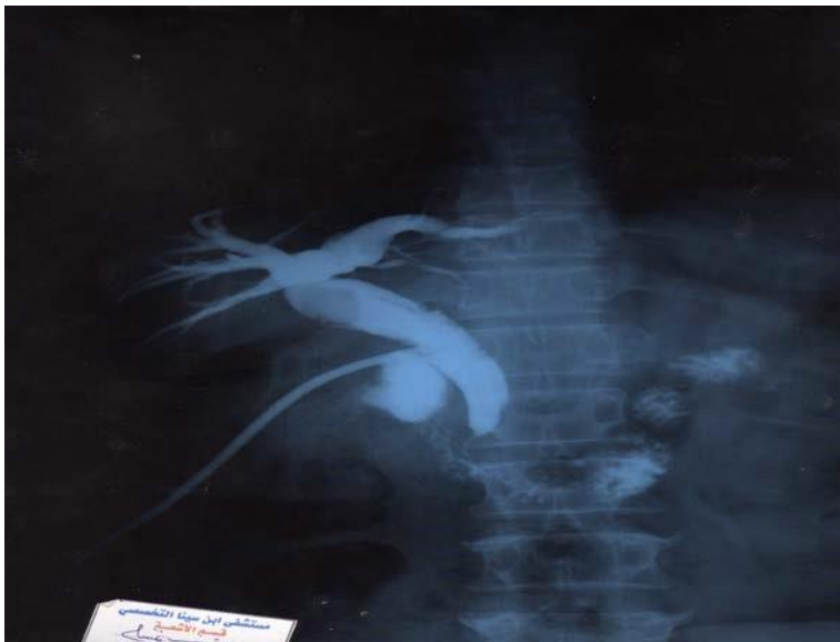
Figure 2: Intraoperative Cholangiogram