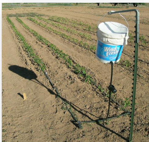
Figure 1: Components of family drip system.