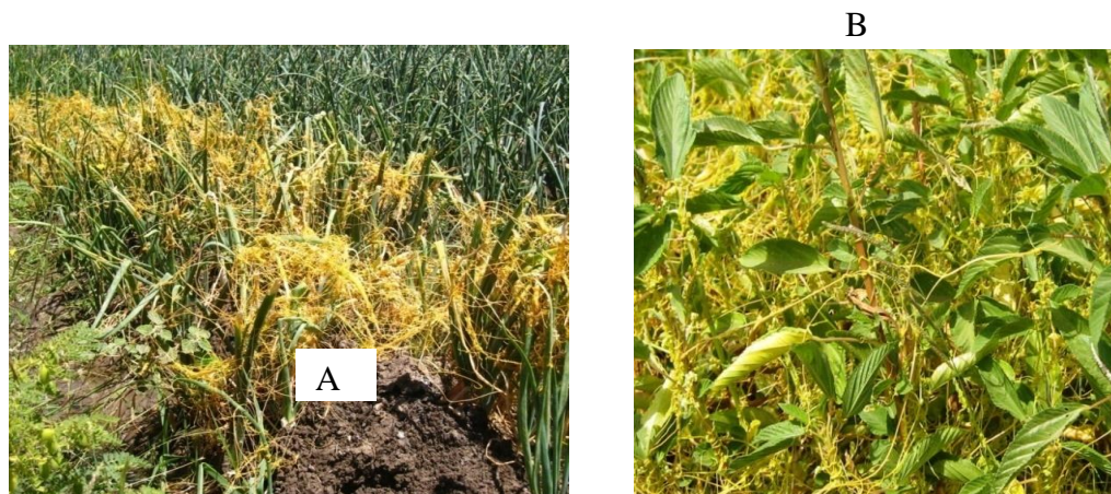
Photo. 2. Onion A, and Molokhia B, parasitized by field dodder.